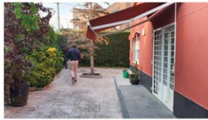
Patio and garage